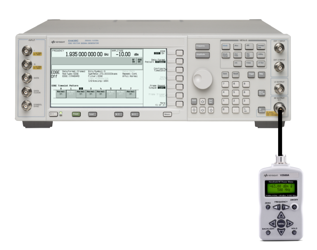
Figure 1. ESG signal generator and V3500A handheld power meter setup diagram

Connect the ESG and V3500A as shown in Figure 1.